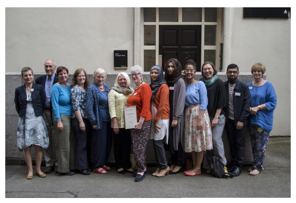
2015 Award winners

The conference included the presentation of the Community Archive and Heritage Awards.